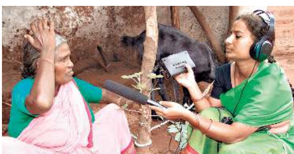
Ears to the ground: The content for Sangham Radio is generated entirely by around 5,000 women.

"When it was born 20 years ago and was 'licensed to broadcast' 10 years ago, Sangham Radio heralded a new media space for the underprivileged, rural peasant women of India," notes the appeal on the crowdfunding webpage, https://milaap.org/fundraisers/dds-sangham-radio. The radio station's