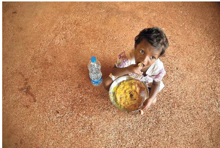
Long way to normality: A girl having breakfast at a relief camp opened in a government school in Ernakulam on Monday.

Domestic flights begin from Kochi naval air base; focus on communications, power & water supply