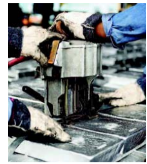
The stake sale will help Novelis to reduce its net debt burden.

Novelis and Kobe Steel will jointly own and operate the Ulsan facility, with both companies remaining responsible for its metal sup-