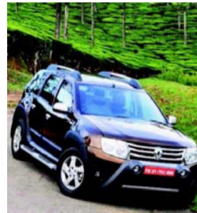
A model with an airbag too fell short.

On Renault's request, Global NCAP also tested the