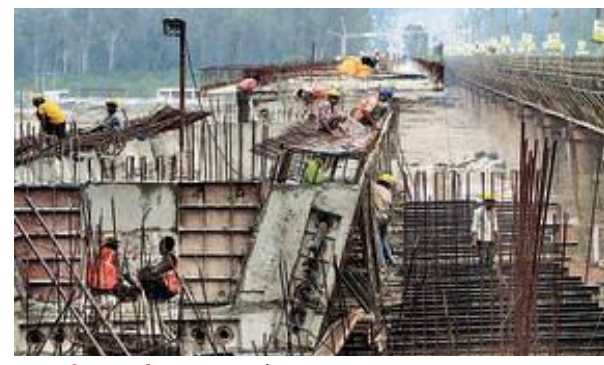
Stepping on the gas: Accelerating private sector investments is an essential complementarity, says Crisil.

about ₹7 lakh crore to build more than 83,000 kms of highways by 2022.