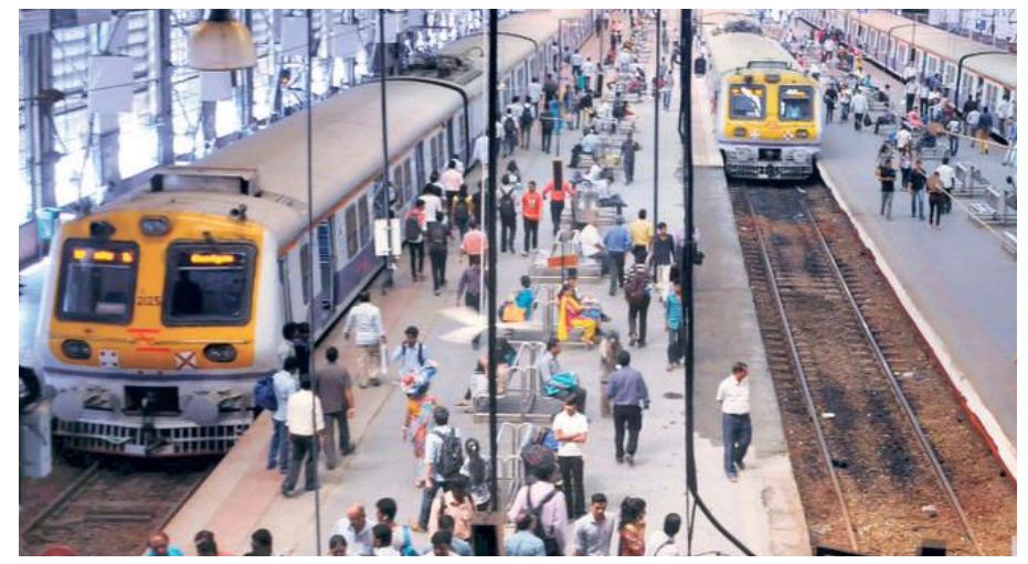
Safety concerns: The public utility is willing to spend unlimited funds on safety, according to Minister of Railways Piyush Goyal.

As earnings fall, Railways knocks on Finance Ministry's door