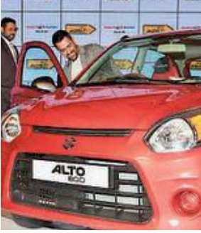
Last year, Maruti Suzuki exported 54,008 units.

It is now the secondlargest exporter of passenger cars from India behind MSI. Last year, it had exported