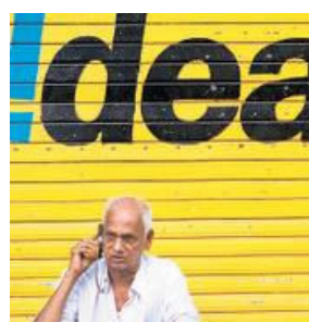
"This equity infusion reiterates the Group's commitment towards the telecom business and confidence in its growth prospects."

"Idea Cellular Limited, the third-largest wireless operator in India by subscribers, [on Monday] completed the allotment of 326,633,165 equity shares to the Aditya Birla Group entities, at an issue price of ₹99.50 per share [including a premium of ₹89.50 per share] aggregating to ₹3,250 crore," the company said in a statement. Group chairman Kumar Mangalam Birla said: