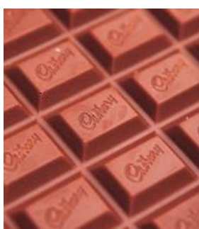
related to production at the same Indian facility," Mondelez International said in the filing. It said it had contested these demands.

"In February 2013 and March 2014... Mondelez India Foods Pvt. Ltd., and other parties received show-cause notices from Indian Central Excise Authority calling upon the parties to demonstrate why the Excise Authority should not collect a total of ₹3.7 billion ($59 million as of December 31, 2017) of unpaid excise tax and an equivalent amount of penalties as well as interest,