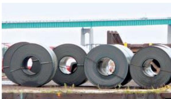
New hope: In its offer, ArcelorMittal India has set out a plan for Essar aimed at improving its performance and profitability.

ArcelorMittal has submitted its bids through its subsidiary ArcelorMittal India Pvt. Ltd. (AMIPL) and in its offer, AMIPL has set out a detailed plan for Essar aimed at improving its performance and profitability and ensuring it "can participate in the