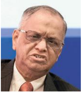
N.R. Narayana Murthy