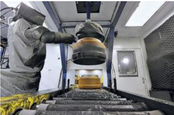
Smart tech: The new policy would aim at making India a manufacturing hub.

Wide consultations Commerce and Industry Minister Nirmala Sitharaman would hold consultations on the framework in Chennai, Guwahati and Mumbai with stakeholders, including industry captains, think tanks and State governments.