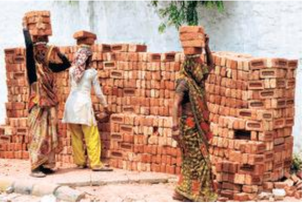
Pain and gain: States will fix minimum wages keeping in mind the arduousness of the work, among other things, the Bill says.