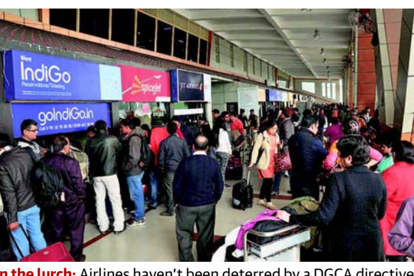
In the lurch: Airlines haven't been deterred by a DGCA directive to pay higher compensation for denying boarding.

Jet Airways accounted for the highest proportion of cases related to boarding denial at 84%, followed by Air India with 11.1% of such cases from August 2016-February 2017, after the higher compensation regulation kicked in.